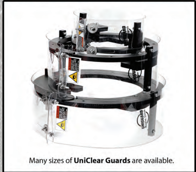
Many sizes of UniClear Guards are available.

The UniClear Guard™ is made from corrosion resistant polycarbonate (shield), high density polyethylene (frame) and stainless steel fasteners.